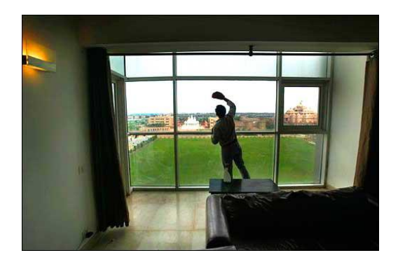
New Zealand PM in favour of pull-out

Expressing his "serious concern" over safety, security and site preparedness, Canadians Sports Minister Gary Lunn also said, "It's going to take a lot of work (by India) to rectify" these problems."